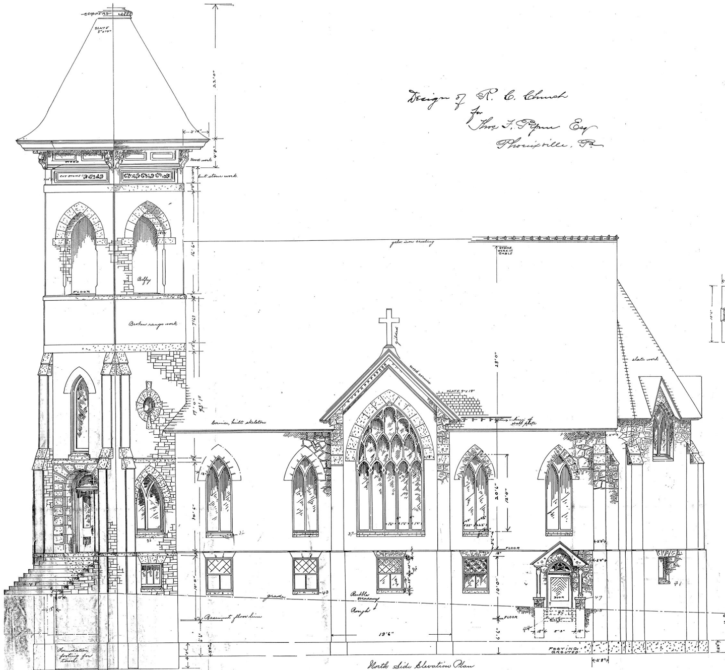
North Side Elevation Plan 1/4" Scale