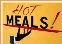
Table Fellowship for the WEEK OF APRIL 23 St. Peter's Church 121 Church St.

Sun: Acts 2:42-47/1 Pt 1:3-9/Jn 20:19-31 Mon: Acts 4:223-31/Jn 3:1-8 Tues: 1 Pt 5:5b-14/Mk 16:15-20 Wed: Acts 5:17-26/Jn 3:16-21 Thu: Acts 5:27-33/Jn 3:31-36 Fri: Acts 5:34-42/Jn 6:1-15 Sat: Acts 6:1-7/Jn 6:16-21 Next Sun: Acts 2:14,22-33/1 Pt 1:17-21/Lk 24:13-35