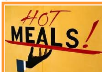
Table Fellowship for the WEEK OF APRIL 2 St. Peter's Church 121 Church St.

Sun: Ex 37:12-14/Rom 8:8-11/Jn 11:1-45 Mon: Dn 13:1-9,15-17,19-30,33-62/Jn 8:1-11 Tues: Nm 21:4-9/Jn 8:21-30 Wed: Dn 3:14-20/91-92,95/Jn 8:31-42 Thu: Gn 17:3-9/Jn 8:51-59 Fri: Jer 20:10-13/Jn 10:31-42 Sat: Ez 37:21-28/Jn 11:45-56 Next Sun: Is 50:4-7/Phil 2:6-11/Mt 26:14—27:66